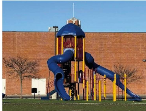
Grade School Playground